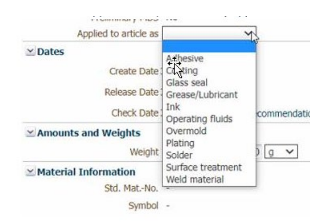
Fig.4. Structure mix