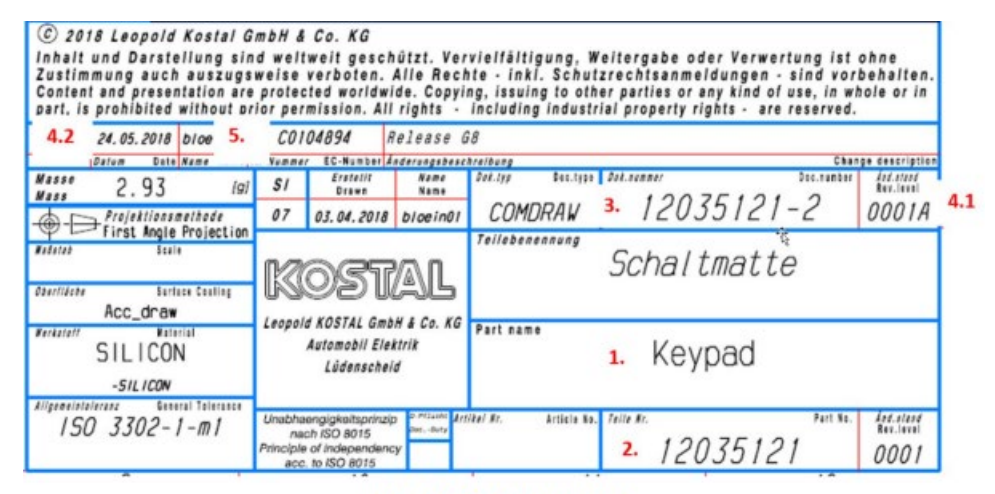
Fig.1 KOSTAL drawing